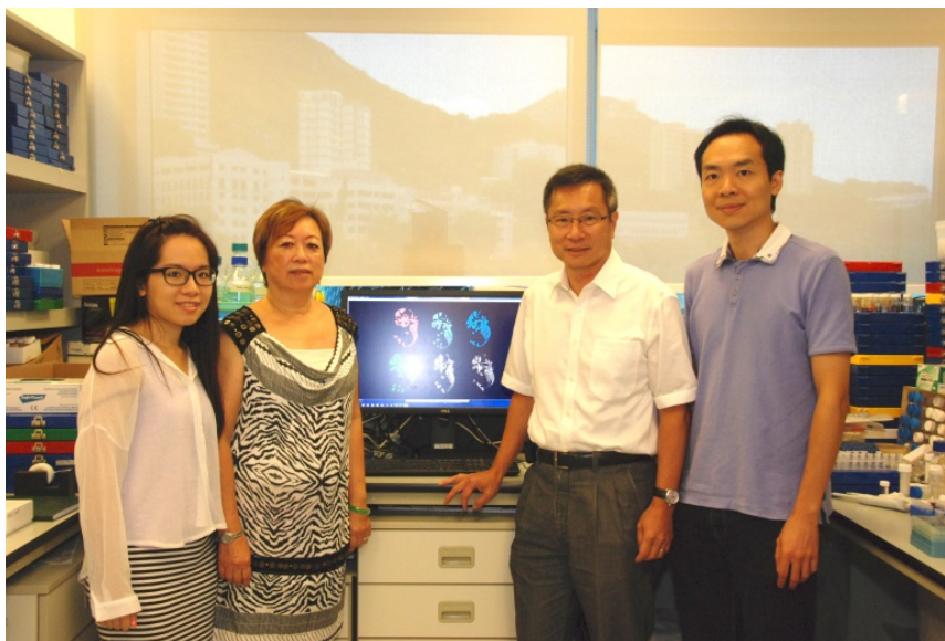
Group photo of the research team from Department of Biochemistry, Li Ka Shing Faculty of Medicine, The University of Hong Kong